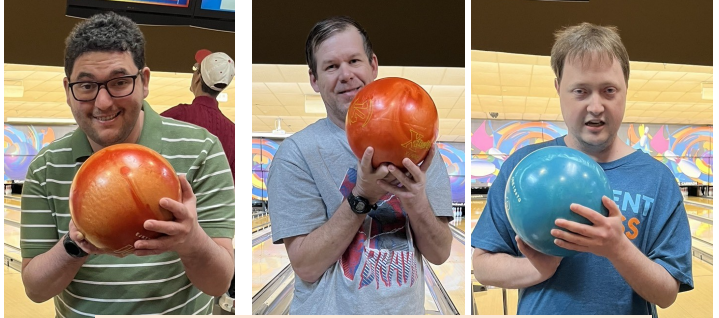
Chillin' Like Villains Bowling at SpareTime