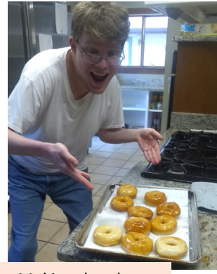
Yummm .. Making doughnuts