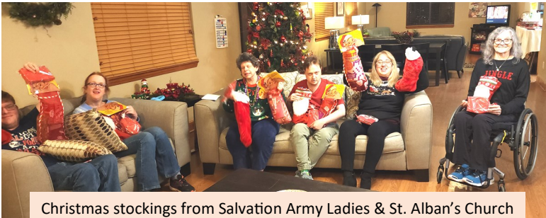
Christmas stockings from Salvation Army Ladies & St. Alban's Church