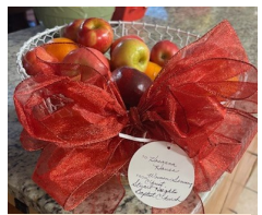
Stuart Heights Gift