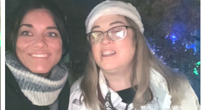
The DreamNights Asian Lantern Festival was Amazing!!