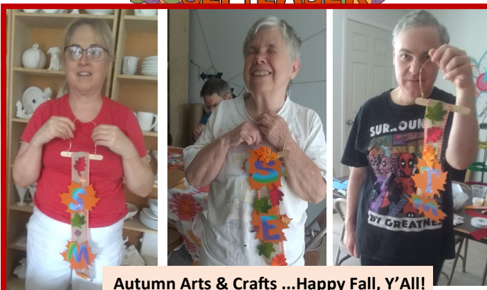
Autumn Arts & Crafts ...Happy Fall, Y'All!