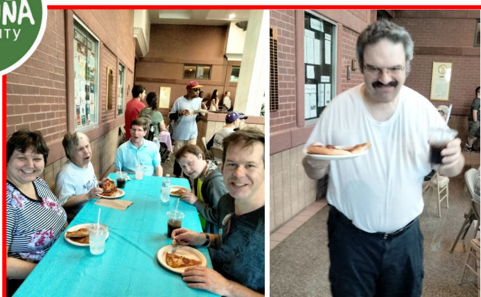
Chillin' Like Villains: Pizza & a Movie at the East Ridge Library