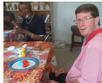
Making a 'Garden Snake' out of painted rocks. Isn't he cute??!!