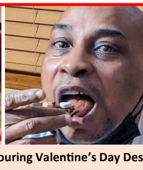
Devouring Valentine's Day Desserts!