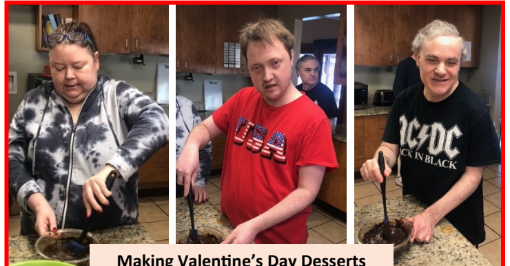
Making Valentine's Day Desserts