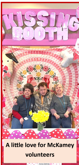
A little love for McKamey volunteers