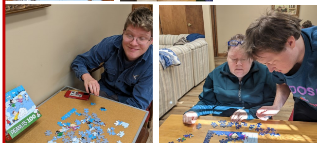
A Charlie Brown Christmas - Hosanna style!