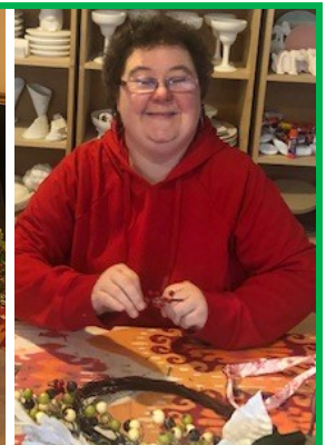
Making Wreaths for the Holidays