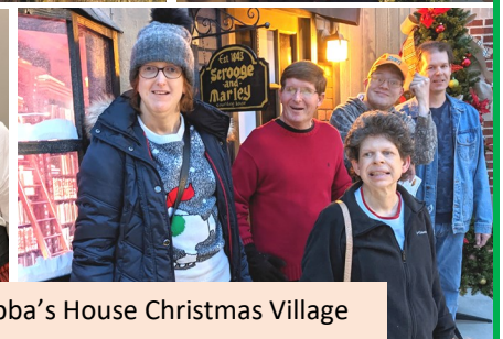
Fun at Abba's House Christmas Village