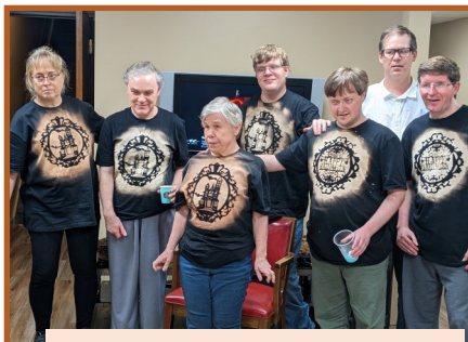
Halloween & More Halloween!