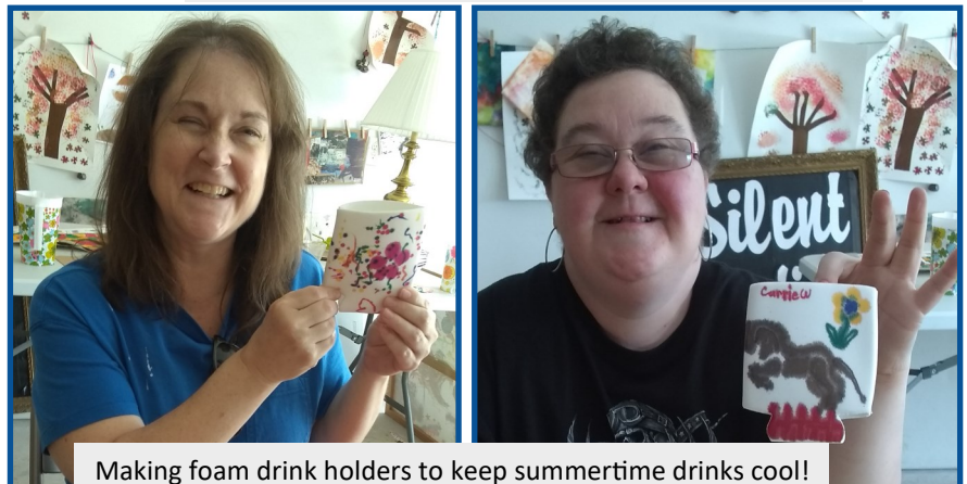
Making foam drink holders to keep summertime drinks cool!