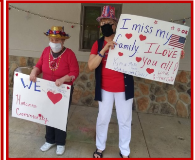
Memorial Day 2020 @ Hosanna. What a difference a year makes!