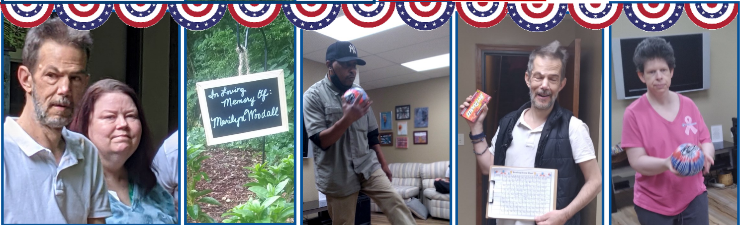
Is there such a thing as too much bowling?!? Naahh!!