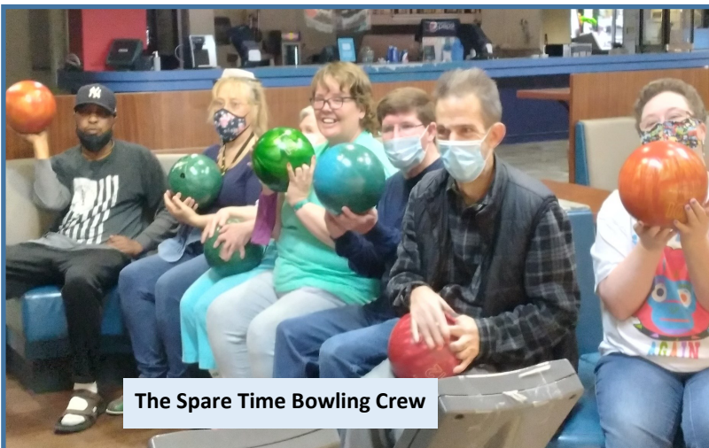
The Spare Time Bowling Crew

Isn't it interesting that when a person is making a presentation, such as a sermon, their topic is tailored for the audience, and select words are chosen to gain a differing reaction based on who is present? Well, let me explain: I do feel when we speak or write, we need to consider the true consequences of what we are saying. I am also adamant in my belief that it is everyone's best interest to seek HIS help - first. Bringing forgiveness while also offering salvation definitely defines the Lord. But let's all remember the main reason for the birth of Christ: The heavenly gift of the chance to obtain eternal life. I feel that no matter who you are, it is a real nice consequence following an easy choice. It's yours to make. I wish you the best.