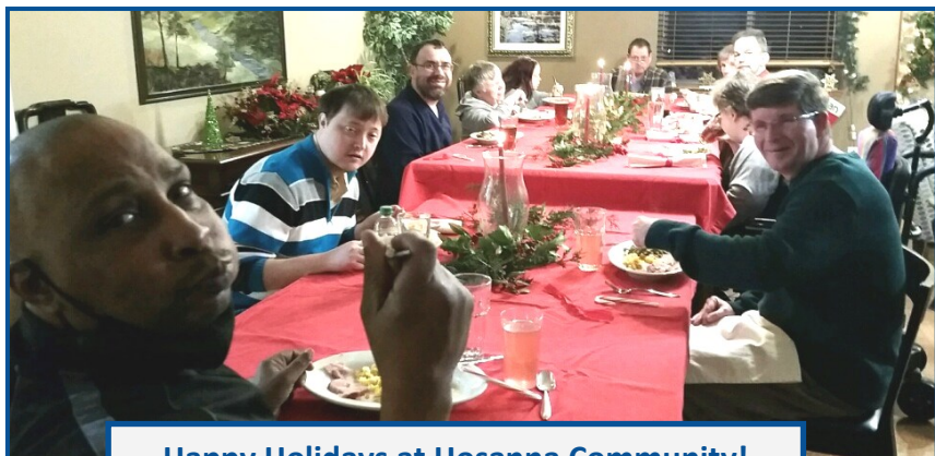
Happy Holidays at Hosanna Community!