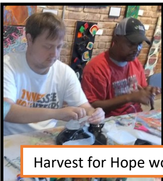
Harvest for Hope work at the Hart Gallery