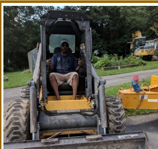
Weldon F. Osborne Foundation, Inc.