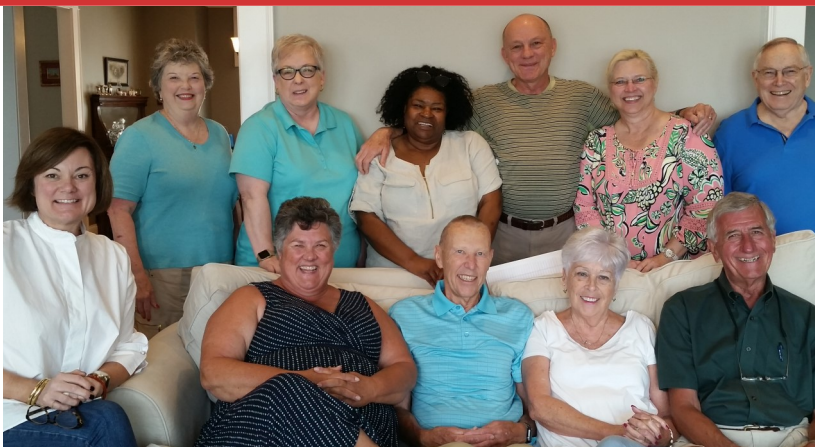
2018-2019 BOARD OF DIRECTORS