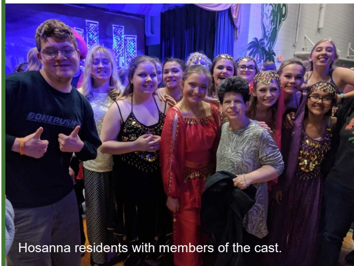
Hosanna residents with members of the cast.