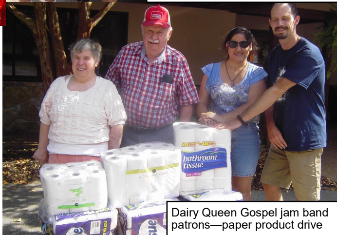
Dairy Queen Gospel jam band patrons—paper product drive

Stuart Heights Baptist Church —providing weekly transportation to church and a monthly dinner for Faith House