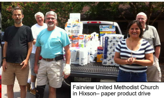
Fairview United Methodist Church in Hixson—paper product drive