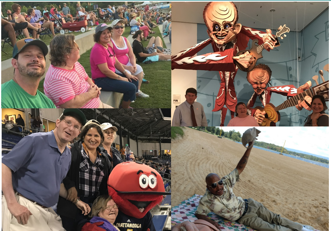
Our residents were out and about this summer enjoying some of the many pleasures Chattanooga has to offer. Clockwise from top: Riverfront Nights concert, Hunter Museum, Chester Frost Park, and a Chattanooga Lookouts game.