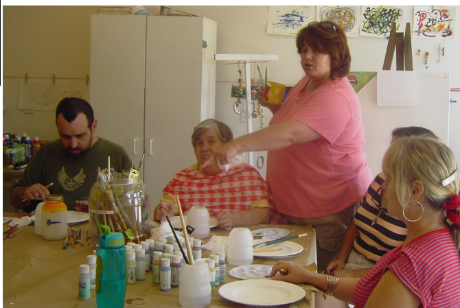
Above: Residents enjoy all kinds of creative activities in the Treehouse. Below: Making centerpieces at CABIA last month for their upcoming fundraiser. Lots of fun!