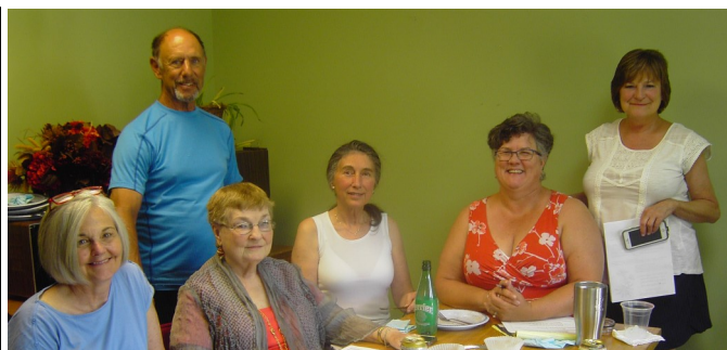
Hosanna's executive committee hard at work planning this year's Harvest for Hope fundraiser on October 6..