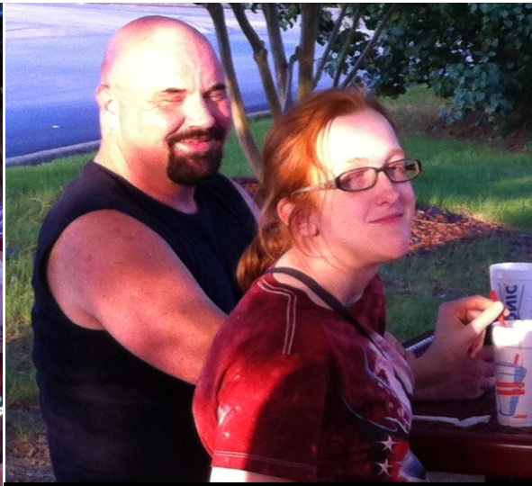
Half price shakes at Sonic: A delicious way to cool off!