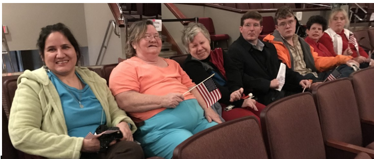
Veteran's Day concert at Memorial Auditorium.